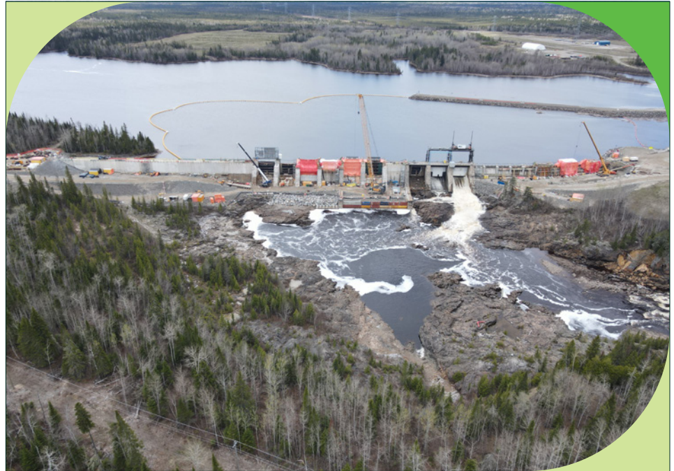
Aerial view of the Smoky Falls Dam Safety project. On left is the East Spillway which has been closed. At centre features the existing Spillway Closure and Sluiceway replacement work. On right is the West Spillway Closure.

The East Spillway involves the closure of 14 Spillways using concrete plugs. This work was completed at the beginning of the year. The East Sluiceway